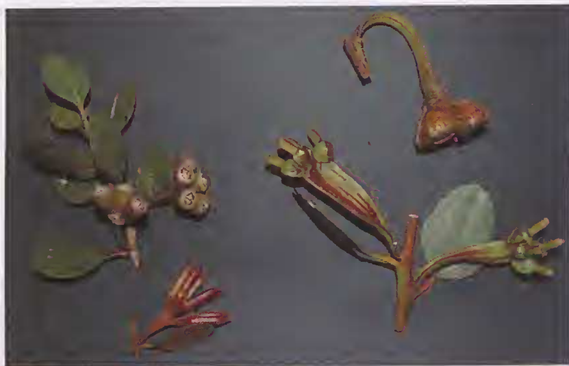
Figure 3. Buds and fruits of E. platypus subsp. platypus Pt Ann and E. nutans.